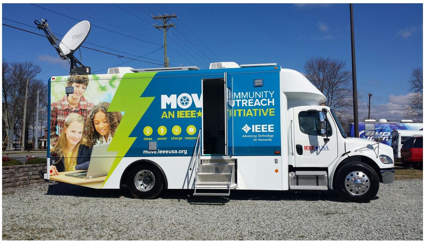
The MOVE truck

The concept of a mobile disaster relief vehicle was