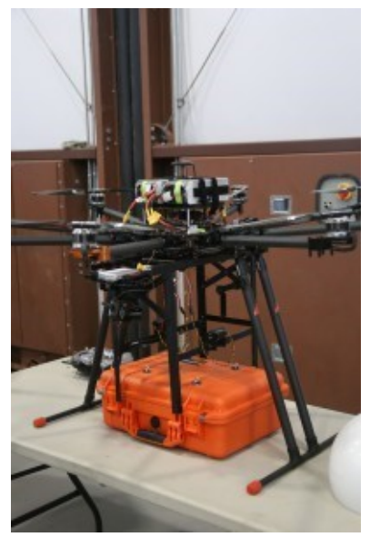
An Unmanned Aerial Vehicle, popularly known as a drone, is equipped with a telemedical package as part of the Telemedical Drone Project, known as HiRO.

https://www.youtube.com/watch?v=3w0wqqO2v1U